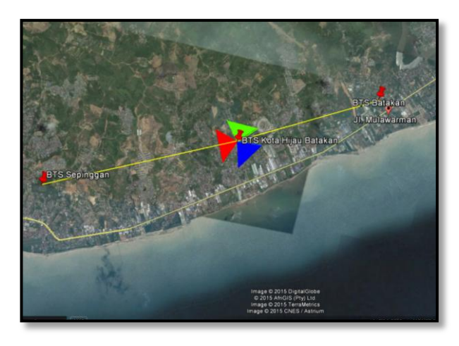
Figure 2 : Safe Distance bts24_Kota Hijau Batakan

on the see of Figure 2 bts124 _ Kota Hijau batakan to coverage already meet safe distance interference good with other BTS Near from bts124 _ Kota Hijau batakan